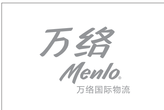
50% Gray Version